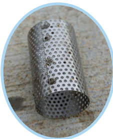
Strainer from the treatment conveyance system